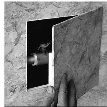
SpringFit Access Panel