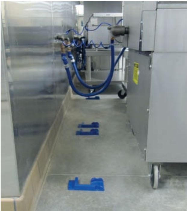
Figure 1 Gas ranges with flexible connectors.

Connectors must be selected to provide the gas demand at the minimum pressure of the appliance. Figure 2 provides a detail of commercial kitchen gas piping requirements. PSD