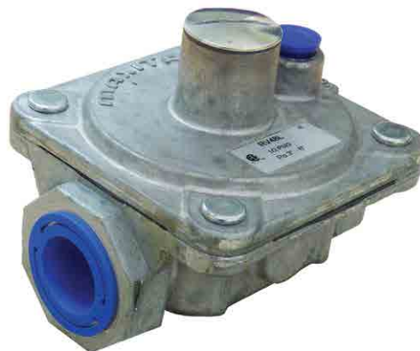
R48P42-0512-10/R48P32-0512-10 (1/2 PSIG Gas System)

Gas appliance regulators are designed for main burner and/or pilot applications, where precise control of tiny flows is an essential operating requirement. Housings are high strength aluminum castings and all models have been tested for multi-position and may be installed in any plane or angle without restriction.