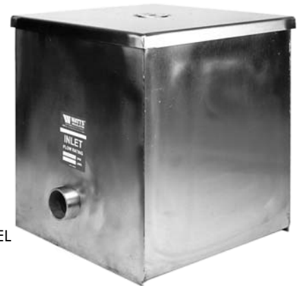
SI-742-M-SS STAINLESS STEEL (OPTIONAL)