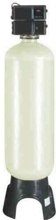
Series AMZ 3"

Watts Series AMZ Micro-Z filters are highly effective backwashing media filtration systems for the reduction of sediment and suspended solids from water.